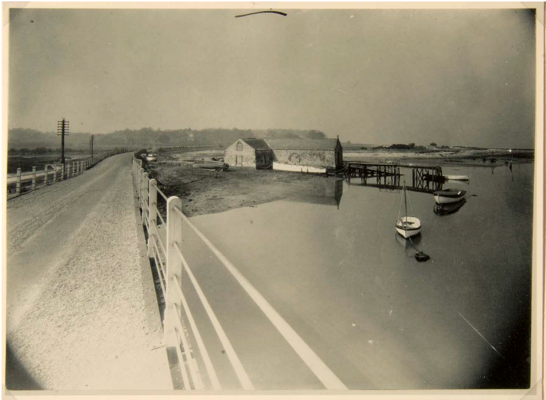
The Sandhouse from Bridge Road c.1926